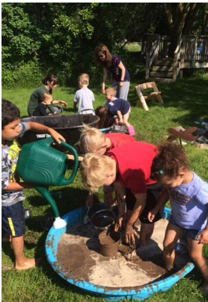
International Mud Day

In July, we piloted a new Little Wings Summer Camp for preschool-aged children. Each day the kids learned about something in nature with wings, played games, and explored the outdoors. The kids had fun eating like butterflies, testing seeds by dropping them off the tower to see if they float, meeting a live song bird and hiking the trails near the Nature Center. Some of the campers' favorite activities included free play in the Little Wings Nature Play Area at the end of each day, Drip, Drip, Drench (Duck, Duck, Goose with water) and dipping in the pond. Watch our calendar in late winter for information about next year's summer camps.