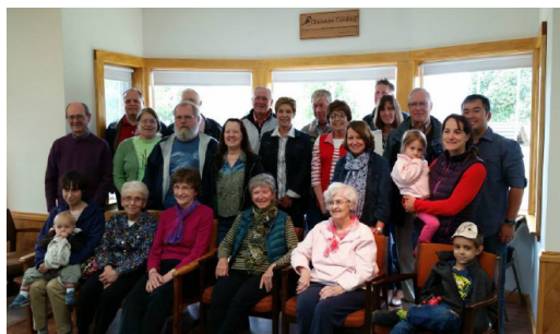
Thank you to the Alyea family for making our bird viewing area possible

Even with the weather being a little chilly this year, Bird Breakfast and the Grosbeaks Galore Workshop was a lot of fun! About 100 people attended overall and enjoyed a ham and pancake breakfast sponsored by Browns of Two Rivers, coffee and a free sample of mixed bird seed from SeedsNBeans, on-going kids' activities, nature hikes, free native shrub or tree, and bird banding demonstrations. Thank you to all of our volunteers that made this day possible!