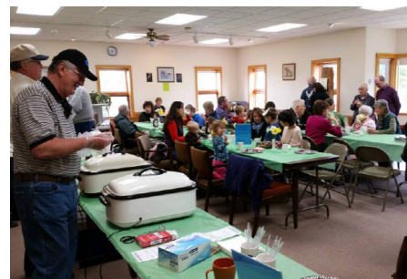
A ham and pancake breakfast