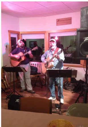
Schmidt Happens playing music in Chickadee Landing

Thank you to our members and friends who attended this year's Candlelight Night and helped us reach record-breaking attendance of two hundred and forty-seven people! Participants enjoyed s'mores, hot beverages, warming fires, astronomy, live music and a beautiful evening walk/snowshoe on the candlelit trail. Thank you Cellcom for sponsoring this fabulous event!