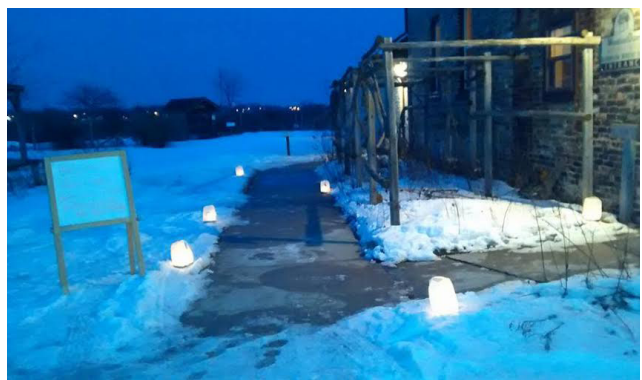
Lanterns lighting the walkway at the Nature Center