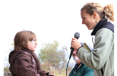
Owl Hooting Contest