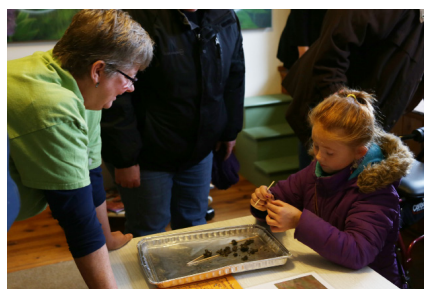
Owl Pellet Dissection