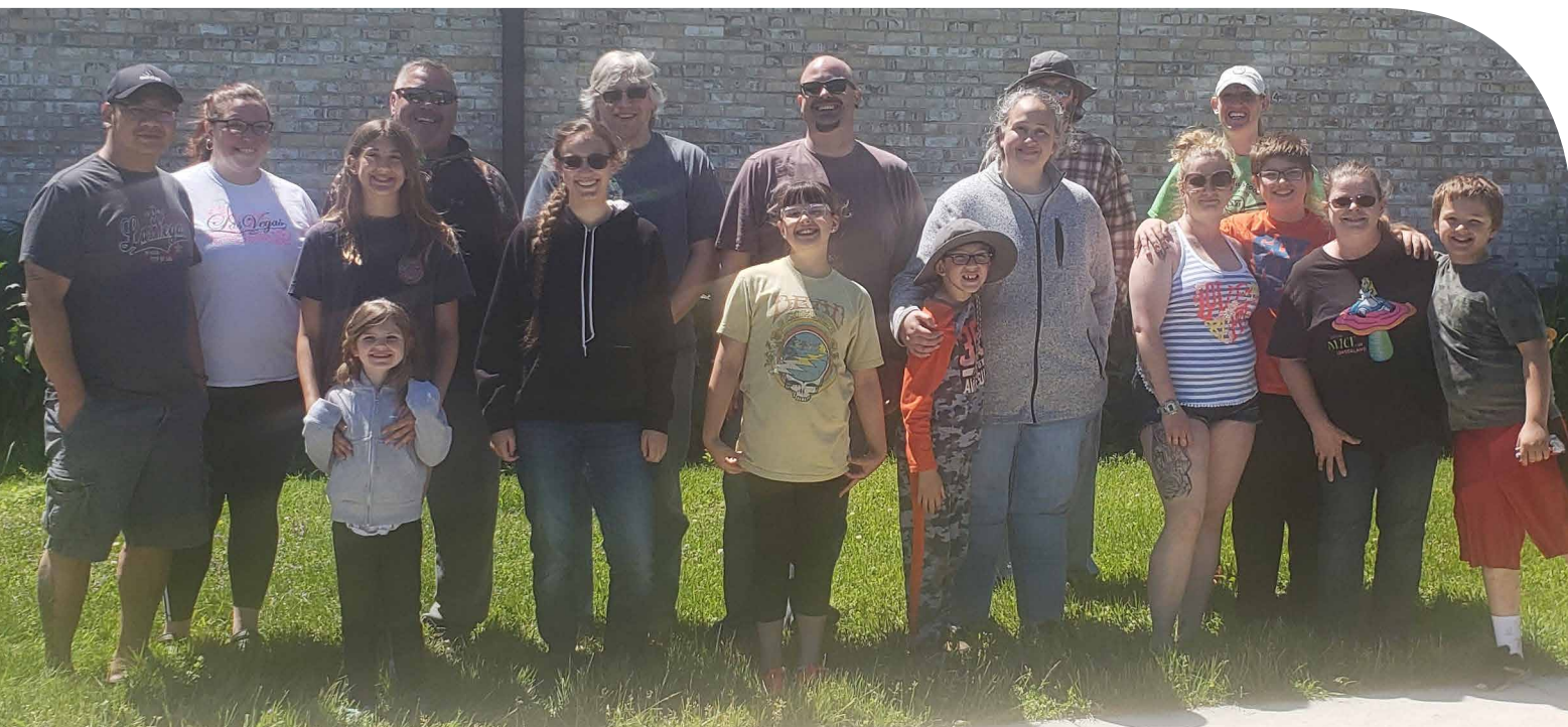
Thank you to VT Industries and volunteers for sponsoring and planting 25 trees on our preserve!