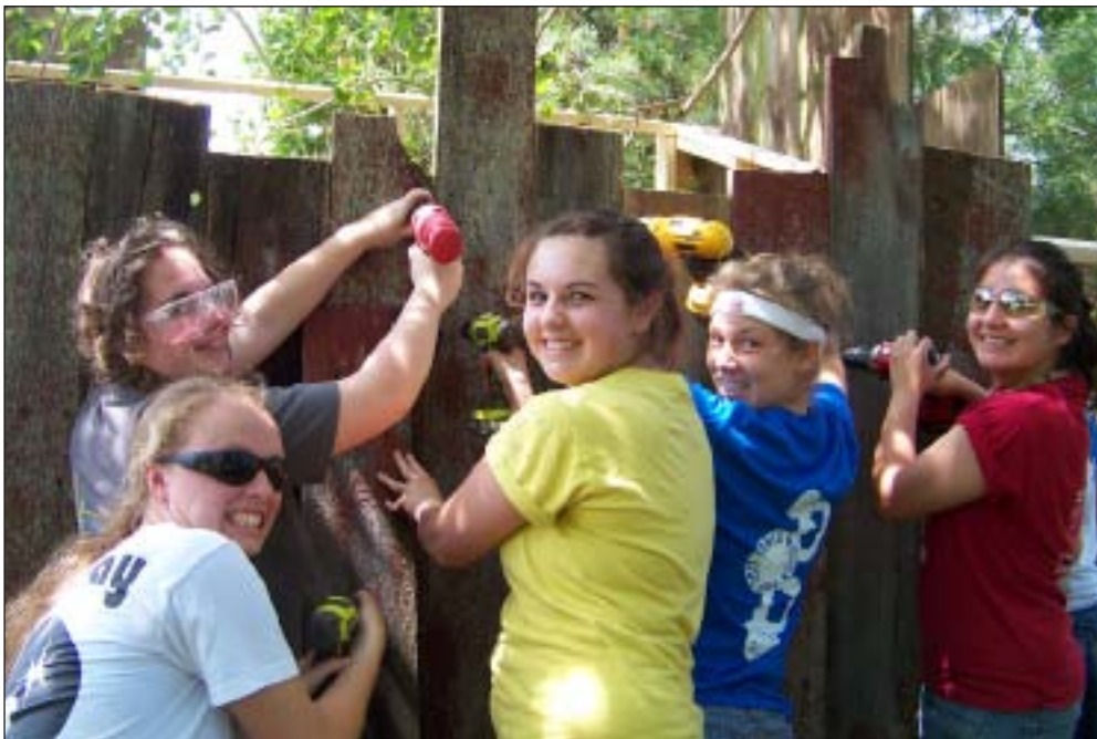
Volunteers from Grace Congregational Church work on a structure in the Little Wings Natural Play Area.