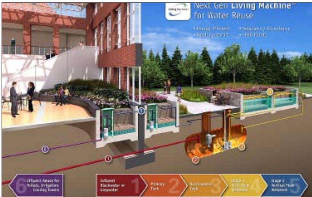
The Living Machine technology, developed by John Todd to be a biological, self-contained waste water treatment plant.

Although we do not know of any local examples of wetlands constructed to treat wastewater, Woodland Dunes marsh receives and filters stormwater from the Columbus St. area in the city, and from Hwy. 310. The City of Two Rivers has added a detention pond across the road, but it discharges to the marsh. Before any of this water reaches the West Twin River, it is filtered by cattails, sedges and grasses.