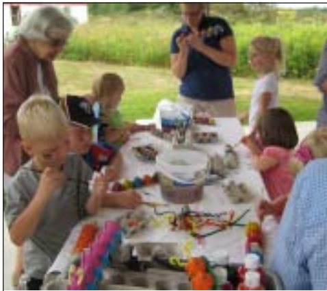
Volunteers work with children learning about art in nature.