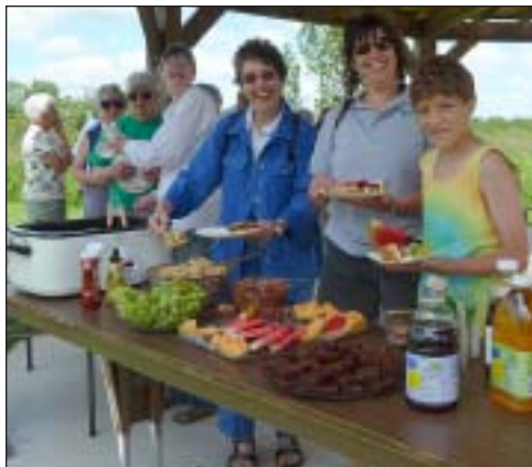
Volunteers enjoy the lunch prepared for them by Woodland Dunes staff at the annual Volunteers' Picnic.

Since 1976, when Woodland Dunes education programs began, over 100,000 small feet have walked the trails. What a wonderful introduction to the world of nature for children! If you are interested in learning more about the natural world and working with students, contact Kelly to learn more about our Teacher Naturalist volunteer opportunities. No experience is necessary and training is provided. Kelly can be reached at (920) 793-4007 or kellye@woodlanddunes.org .