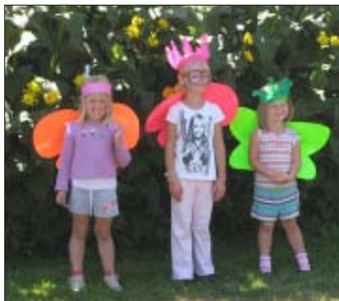
"We have wings just like butterflies and moths!"