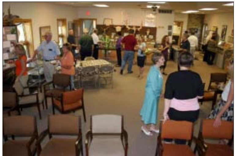
Members of the Chamber of Commerce gathered at Woodland Dunes and met staff and board members during an After Hours event in August.

Waters was set aside as wilderness, and later when air traffic over the wilderness was restricted. Or to imagine that someone like Sigurd Olson could be vilified for his wilderness advocacy. But the same response was heard when Woodland Dunes was proposed. It was seen by some