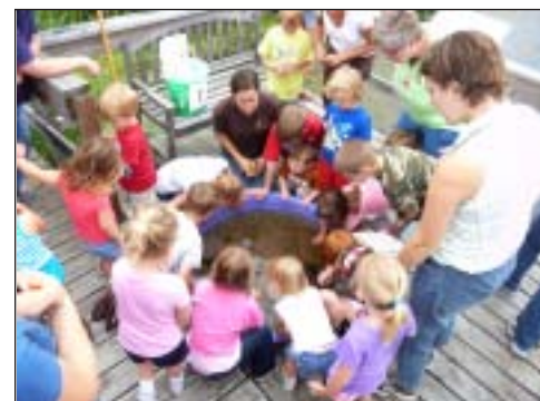
The Little Wings program gave children the opportunity to learn about the creatures and plants of our wetlands.