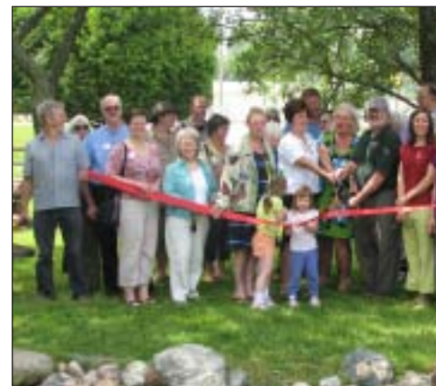
The official ribbon cutting at Little Wings Natural Play Area.