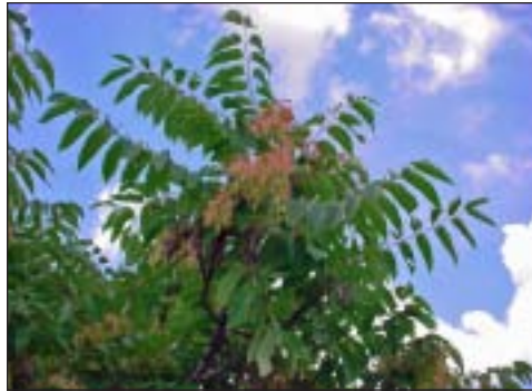
The tree of heaven (Ailanthus altissima)

Like the tree of heaven, all living things must deal with an assortment of compounds found in the environ-