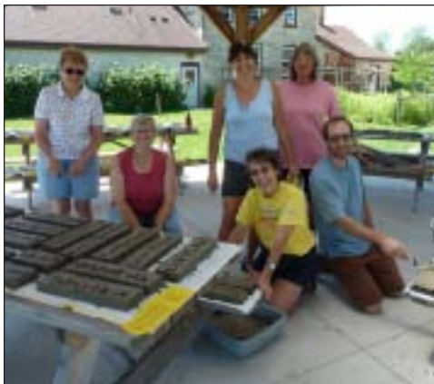
Volunteers create concrete markers to identify plants in the butterfly garden and around the Nature Center.