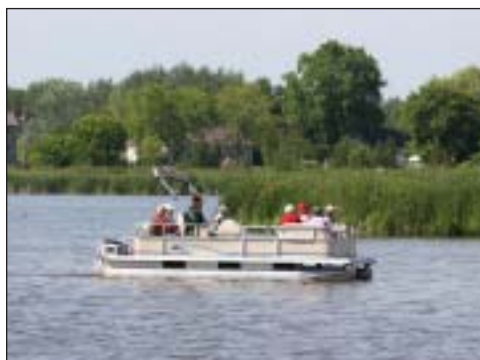
Throughout the summer, pontoon boat trips gave visitors an opportunity to see wildlife along the river and the marsh.

We loved having another set of hands working toward our mission. We hope to have another intern next summer.